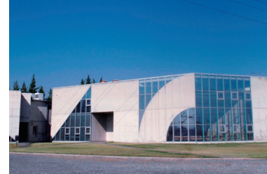
Japan Ukiyo-e Museum