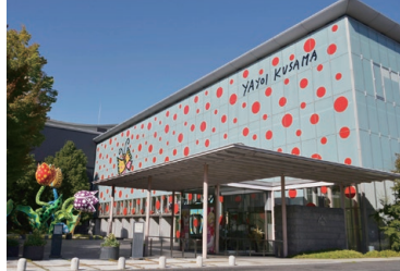
Matsumoto City Museum of Art

*There are some non-participating restaurants and bars.