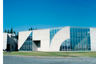
The Japan Ukiyo-e Museum