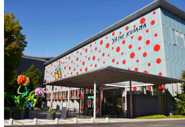
Matsumoto City Museum of Art

- Includes entrance fees for Matsumoto City Museum of Art and the Japan Ukiyo-e Museum, event participation, shuttle bus service, and privileges at AEON MALL Matsumoto.