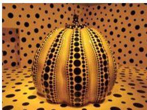
Great Gigantic Pumpkin, 2017

A featured exhibition by Matsumoto-born world-renowned avant-garde artist Yayoi Kusama (born 1929). From works done in her early days in Matsumoto to her recent work My Eternal Soul series, this exhibition puts the path of her soul all in one place. Enjoy this experience of Kusama's present work and her roots in her hometown of Matsumoto.