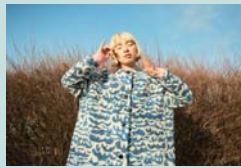
"sea sky" 2025-26 → a/w Photo: Keita Goto(W)