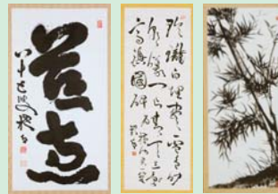
1 2 3

Nakabayashi Gochiku (1827–1913) was a master calligrapher celebrated as one of the "Three Great Calligraphers of the Meiji Era," alongside Kusakabe Meikaku and Iwaya Ichiroku. In his mid-fifties, Gochiku traveled to Qing-dynasty China to study the era's most advanced calligraphic techniques. There, he forged a unique artistic vision, demonstrating extraordinary talent across a wide range of scripts. Although his ancestors hailed from the area near Nakabayashi Shrine in Tsukama, Matsumoto, his roots in the region remain relatively unknown. This exhibition features his representative masterpieces alongside works and historical materials connected to Nagano and the Matsumoto Basin region. We invite you to experience the timeless, modern beauty of this "Sage of Meiji Calligraphy," who breathed new life into the world of modern Japanese calligraphy.