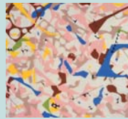
"surplus" 2003-04 → a/w

In 2025, the fashion textile brand minä perhonen celebrated its 30th anniversary since its founding. This exhibition explores the brand's unique approach to creating products while seeking to secure its future for the next 100 years. We present this journey through rare original artwork and textiles, alongside glimpses into embroidery, weaving, and printing factories. This exhibition offers a glimpse into the approach to craftsmanship at minä perhonen, which pursues universal values unaffected by trends.