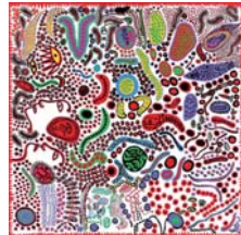
Endless Life of People, 2010 ©YAYOI KUSAMA