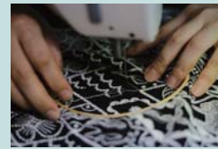
Repair Work at the Embroidery Factory: Close-Up View